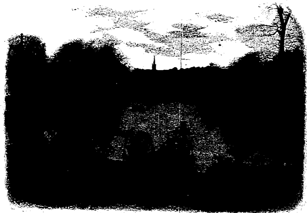
The Motala river from the grounds of the Institution