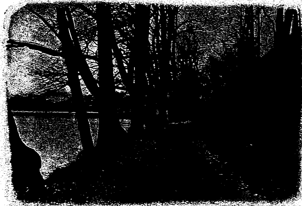
The Strand Promenade