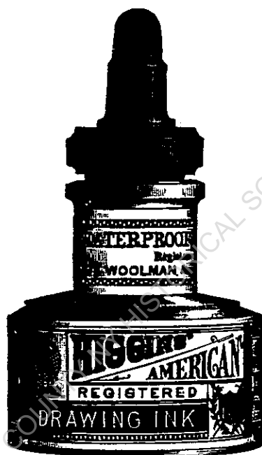
BOTTLE OF INK WITH STOPPER—(Full Size.)