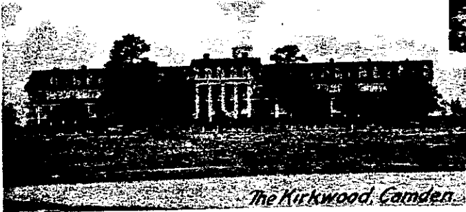
The Court Inn, Camden