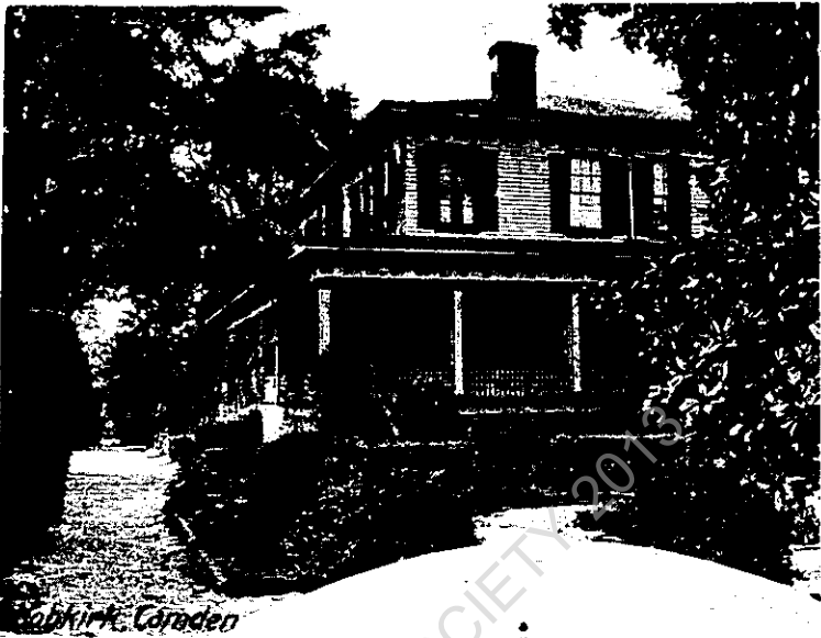
The Kirkwood, Camden