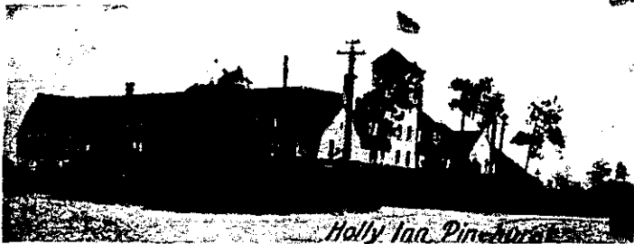
Holly Inn, Pine Bluff