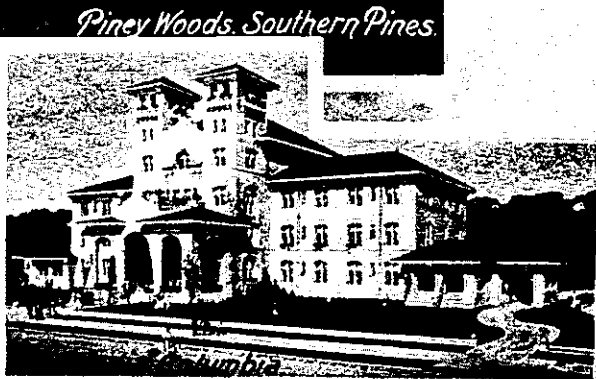
Piney Woods, Southern Pines