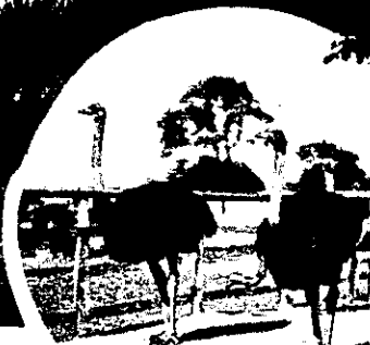
Ostrich Farm, Jacksonville