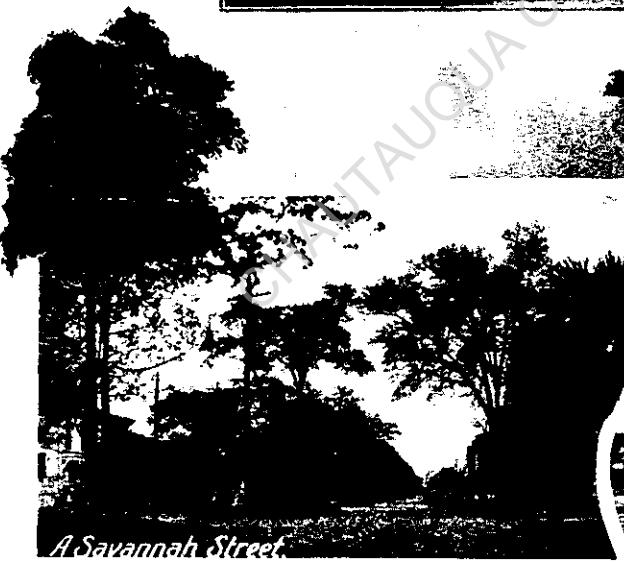
A Savannah Street