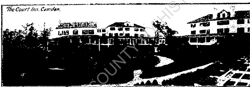
The Court Inn, Camden