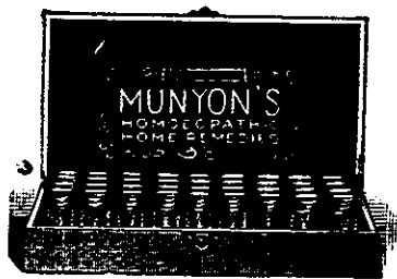
Medicine Chest No. 2, Open.

Every household should have a case of Munyon's Homœopathic Home Remedies. They not only preserve health, but they are a source of economy. There are thousands of cases where a few doses of Munyon's Remedies will prevent long spells of illness, and families who have our Home Medicine Chests soon find that a case pays for itself a hundred times over in the amount that is saved in doctor's bills.