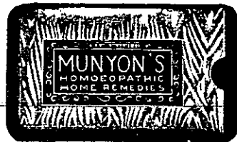
Pocket Case, Closed.

OUR NUMBER THREE CHEST is made like number two chest, and contains any twelve of our 25-cent CURES. Price, $2.50.